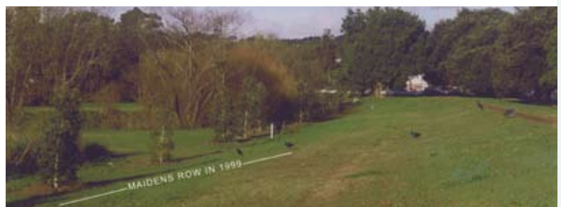
Top: Maiden's Row as it looks today, thriving. Bottom: Maiden's Row when it was first planted (photos taken in opposite directions).

The trees were planted in an unusual sequence of a lone tree, followed by a gap, a group of three trees followed by another gap, running the length of Kensington Pond. This sequence can be seen in several of Maiden's original windbreaks throughout the Parklands.