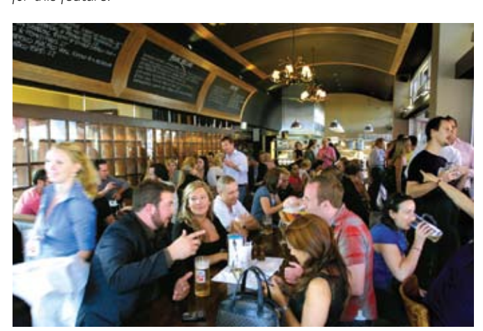
Above: Try German hospitality at the Bayarian Bier Café.

Our thanks to the Entertainment Quarter for providing the information for this feature.