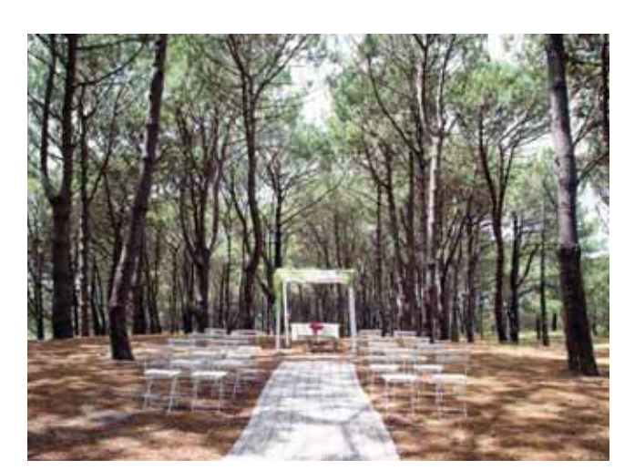
Styling and hire: blesseddays.com.au