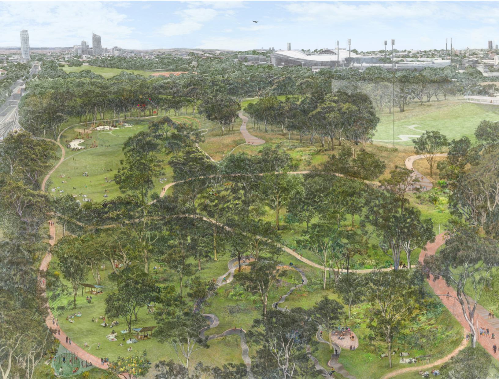
Artist impression of the new park looking towards Mount Street