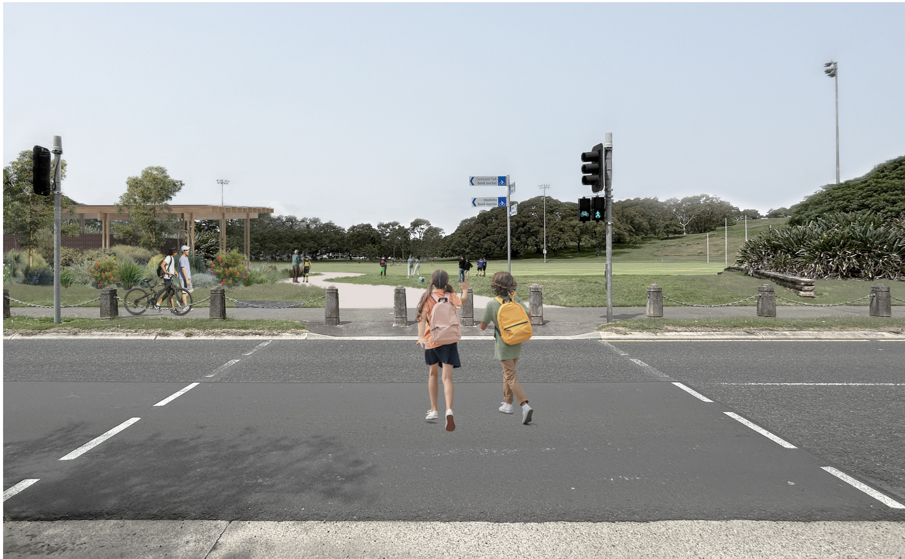
Artist's impression - View from Charles street

Concept image showing proposed new amenities and pathways from Charles street