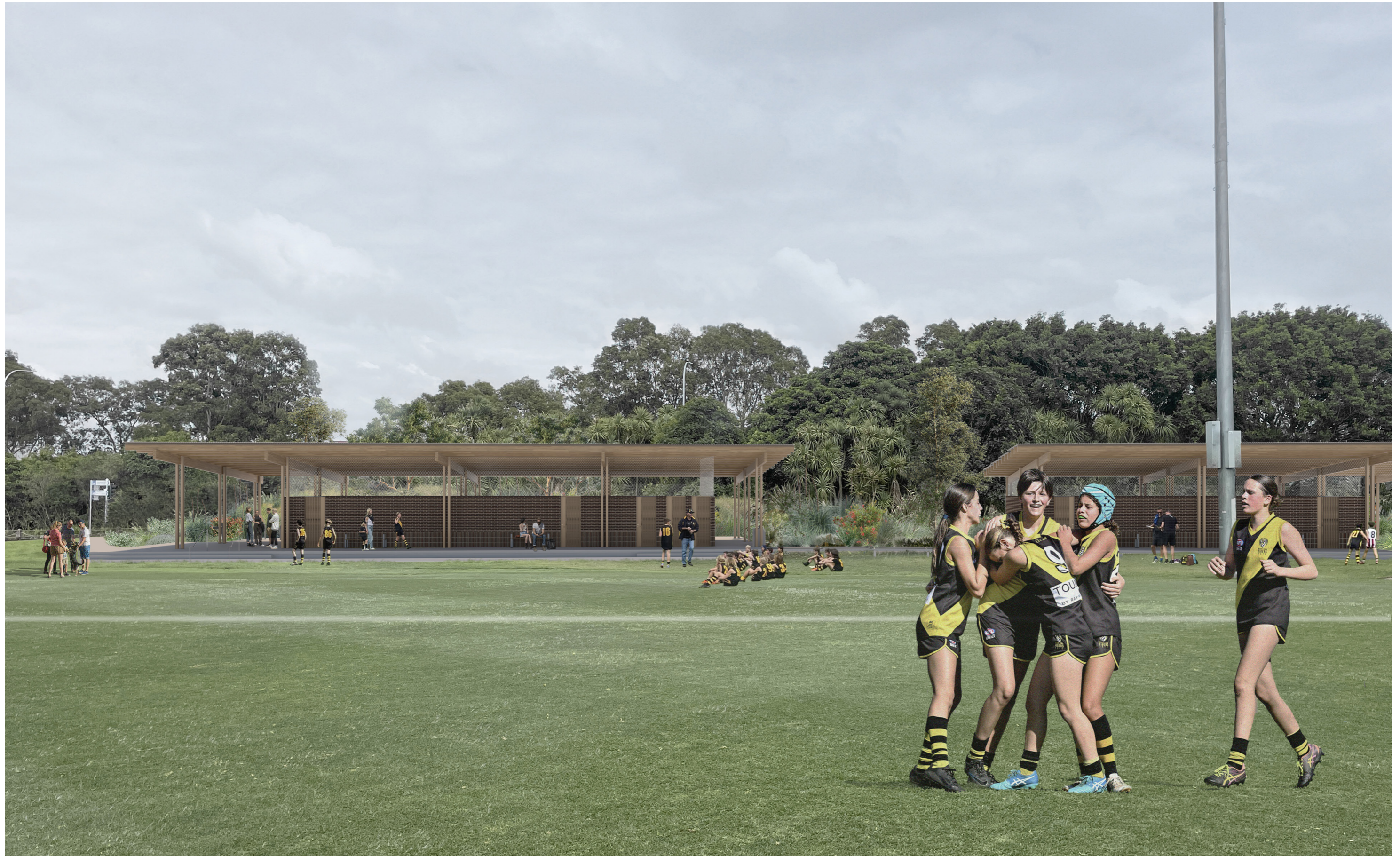
Artist's impression - View from field

Concept image showing proposed new amenities and pathways from the field