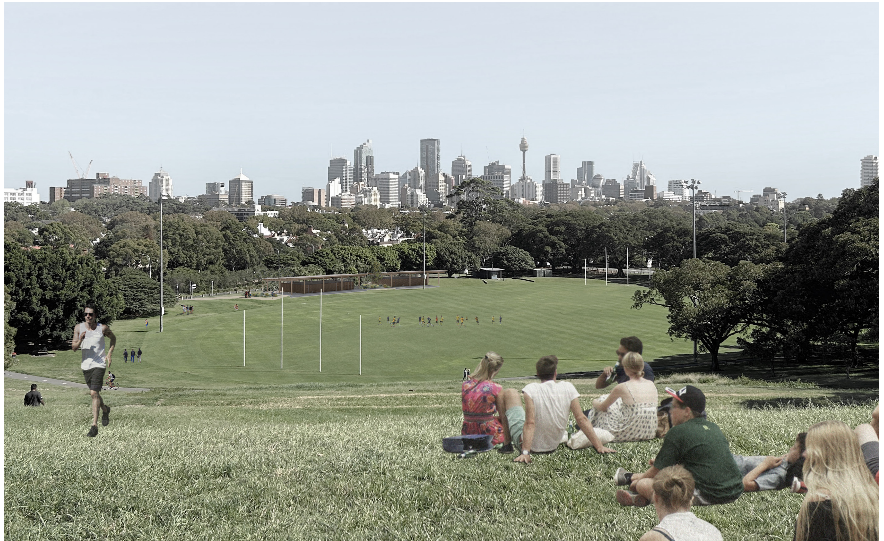
Artist's Impression - View from Mount Steel

Concept image showing proposed new amenities and pathways from Mount Steel