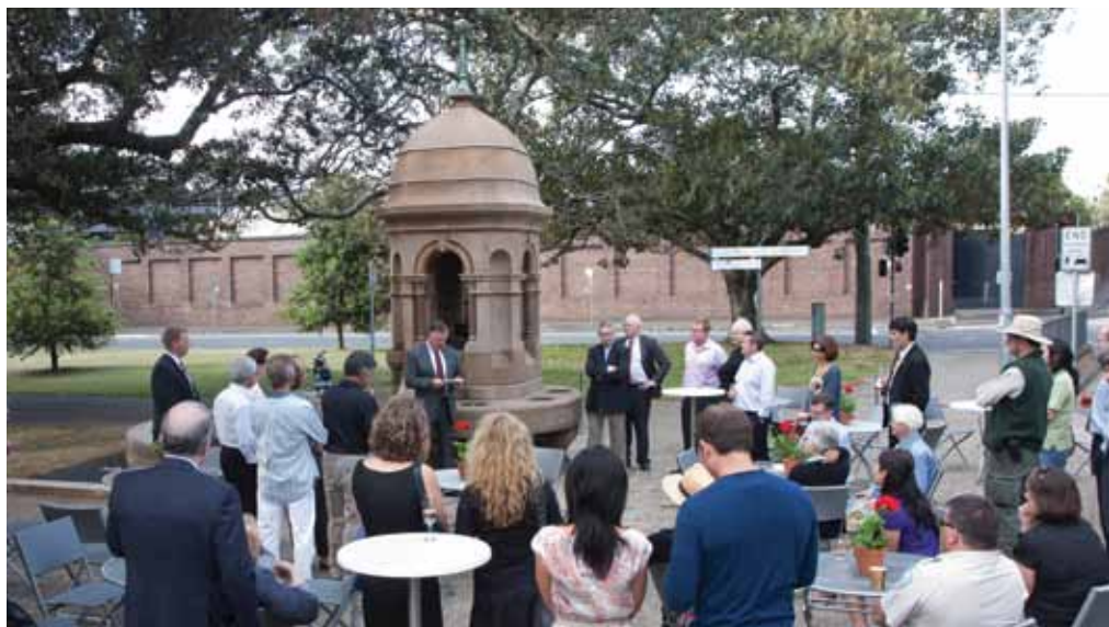
The official unveiling of Comrie Memorial Fountain