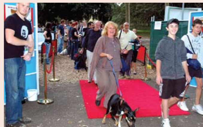
The popular "Dog Night" returns in 2010. Pooches and people welcome!

Bring your own rug or indulge in the Gold Grass experience.