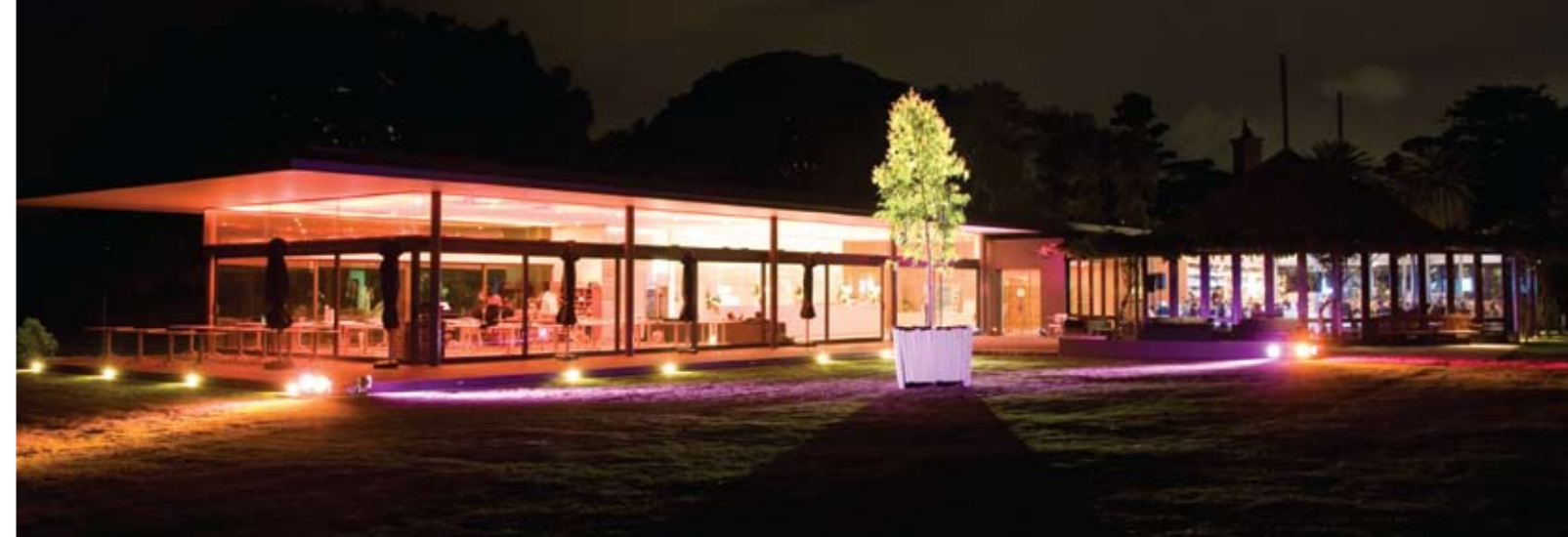
Above: Centennial Parklands shines for the Evergreen Dinner