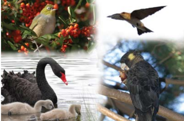
Seasonal birds, clockwise from top left: Silvereye, Fairy Martin, Yellow-tailed Black Cockatoo and Black Swan

Each walk starts from a different place around the Parklands, so even if you've done one before the next one will be different and