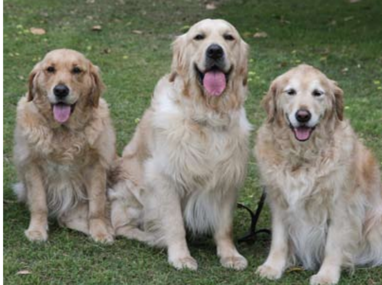
Always ask the owner if you can pat even the cutest looking dogs!

Please take note of the new "No Dog Waste" stickers which have been recently placed on the lids of all recycle waste bins in Centennial Parklands. Dog waste is a major problem for our waste recycling program as it contaminates the material making it useless for recycling and has to be sent to land fill.