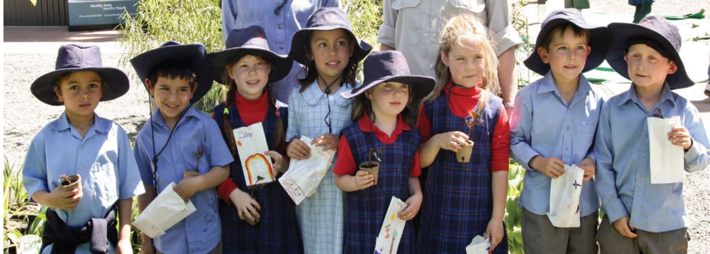
Children from Paddington and Kensington Public Schools participated in a plant propagation workshop

Introducing the Education Precinct – the new centre for educational and community programs within the Parklands.